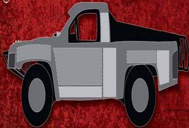
Side Placement View