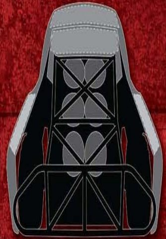
Rear Placement View